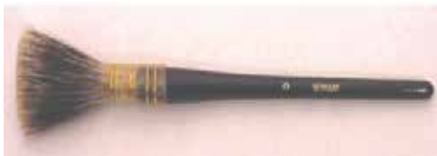
SERIES 32 --- GERMAN ROUND BADGER BLENDER Size 6