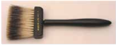
SERIES 31S --- FRENCH BADGER BLENDER Size 3