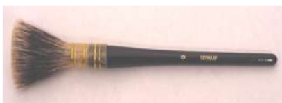
SERIES 32—GERMAN ROUND BADGER BLENDER PRICE EACH SIZE 6 $30.00