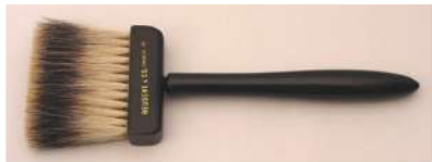
SERIES 31S—FRENCH BADGER BLENDER SIZE 3" $75.00